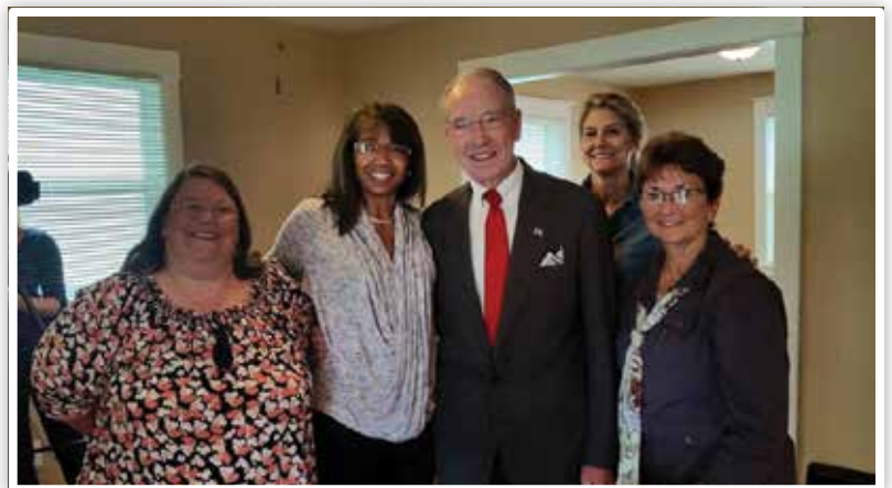
US Senator Chuck Grassley (Iowa) tours our Keeping Families Together supportive housing demonstration site (PUSH-CR) in Cedar Rapids, Iowa, on Saturday, July 12, 2015. The need for additional federal resources to help keep families housed and healthy was raised with Senator Grassley during his visit.