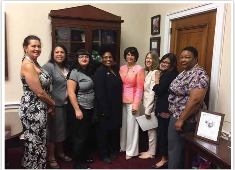
Our Speak Up! Supportive housing resident-community advocates meet with US Representative Lucille Roybal Allard (CA-40) on Capitol Hill (Wednesday, July 15, 2015) to tell their personal stories, how they overcame homelessness through supportive housing, and to request additional federal funding for affordable housing and community-based support services.

CHCDF is a coalition of 70 national organizations, including NLIHC, working together toward the highest possible funding for housing, homeless, and community development programs.