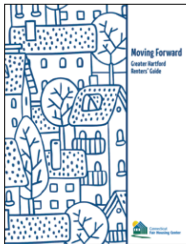
Moving Forward by the Connecticut Fair Housing Center.

Perhaps CFHC's greatest work is in giving residents the tools they need in order to protect themselves against discrimination as they search for apartments. CFHC's Renters' Guide Moving Forward is dedicated to ensuring that renters who want to move can do so, and it has a section dedicated to identifying types of illegal discrimination under the Fair Housing Act, and it instructs tenants on how to contact CFHC to