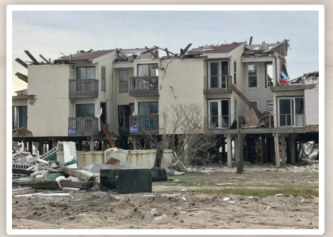
Mexico Beach Florida after Hurricane Michael.

Members of the NLIHC-led Disaster Housing Recovery Coalition (DHRC) in both Florida and California report that months after the storm, hundreds of people remain living in tents, shelters, cars, or in the overcrowded homes of friends or family. FEMA has provided some survivors with rental assistance, money to stay in motels, or trailers, and the agency continues to search for additional places to hook up trailers to plumbing and electricity. However, the process has been slow, and FEMA has refused to utilize the