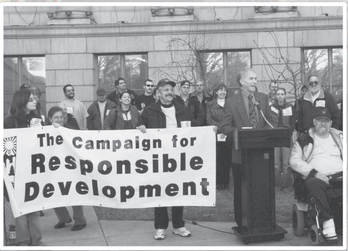
Advocates from United for a New Economy - Denver, Colarado