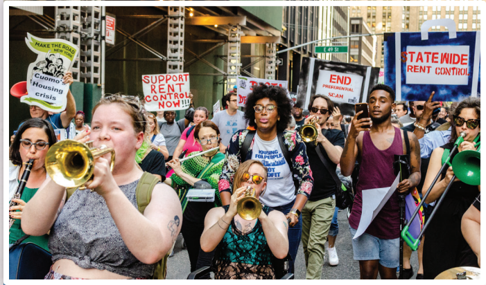
New York Housing March, January 2018.

The ETPA is due to expire in 2019. The Upstate Downstate Housing Alliance sees this as an opportunity to strengthen and expand tenants' rights and is calling for the state to undo provisions that incentivize the loss of rent-regulated units and to extend the rent stabilization framework to the entire state.