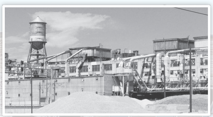
Gates Rubber Factory.