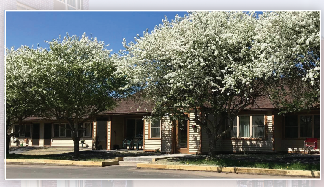
Housing Trust of Rutland County makes renovations to Heritage Courts in Poltney, VT

of the area median income. ZIP codes can be quite large, include a variety of income groups, and contain wealthy pockets or a major university or an arts district in an otherwise poor area. Also, not all OZ ZIP codes need to meet the "low-income" definition; up to 5% of the OZs can include ZIP codes next to a "low-income" ZIP code, as long as the adjacent ZIP code has a median income no more than