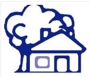
Coming this Winter: Advocacy Skillshare—A Blog to Elevate Ideas and Innovations