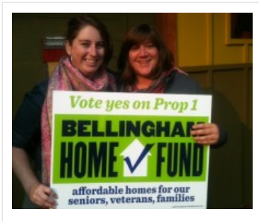
Voters in Say Yes to Levy, Establish Housing Trust Fund in Bellingham, Washington