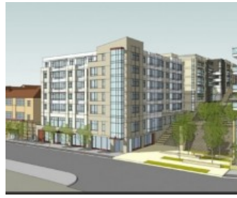
Michigan Allocates $3.7 Million from National Mortgage Settlement to Housing and Community Development Fund