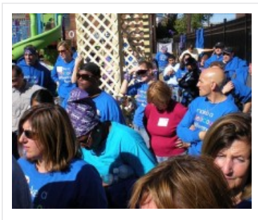
Advocates Launch Campaign to Renew New Jersey Special Needs Housing Trust Fund