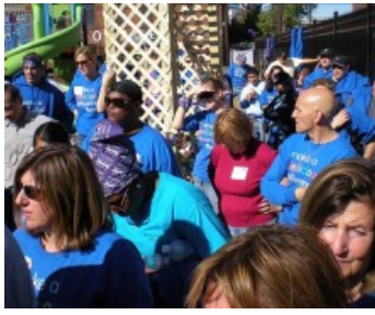
Advocates Launch Campaign to Renew New Jersey Special Needs Housing Trust Fund