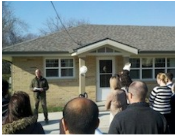
Iowa Housing Trust Fund Makes Awards to Local Housing Trust Funds Statewide