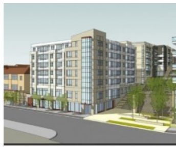
San Francisco Announces First Investment from New Housing Trust Fund