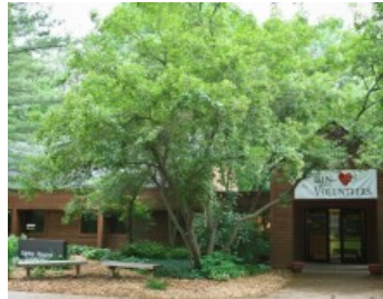
Ann Arbor, Michigan Adds Funds to Local Housing Trust Fund