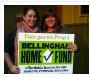
Voters in Say Yes to Levy, Establish Housing Trust Fund in Bellingham, Washington