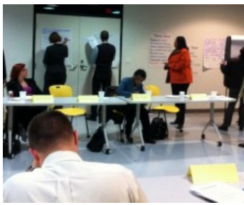
Michigan Allocates $3.7 Million from National Mortgage Settlement to Housing and Community Development Fund