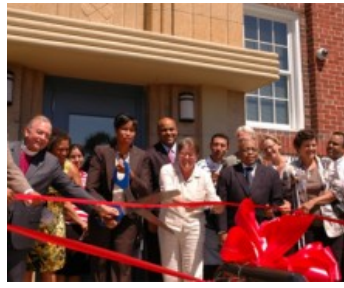
Report Documents A Decade of Progress for Washington, D.C. Trust Fund