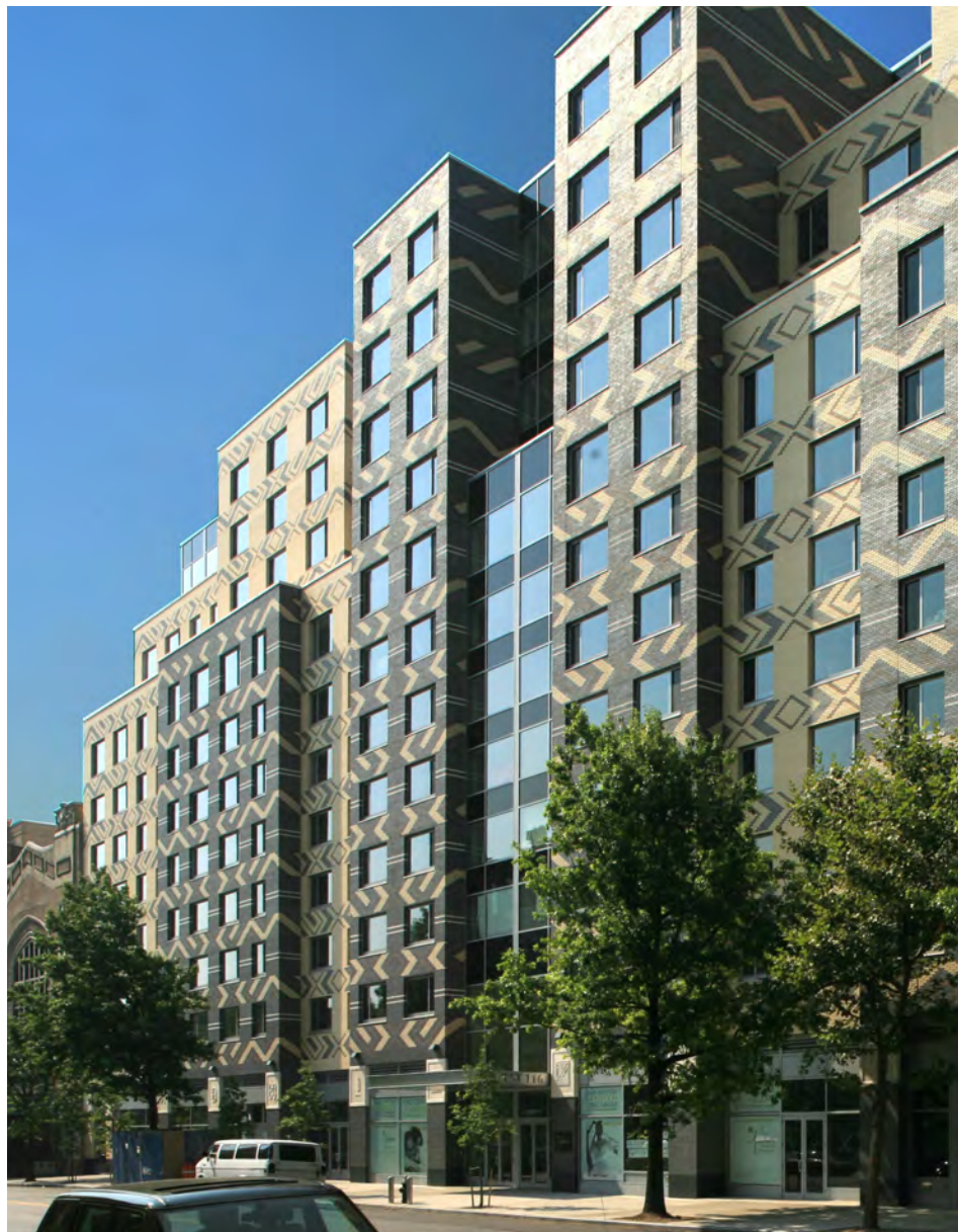
The Kalahari, New York, New York.