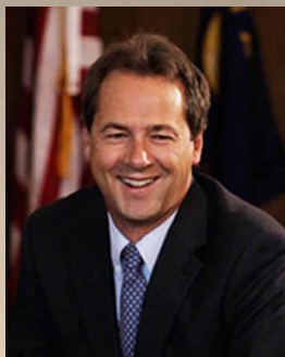
Governor Steve Bullock