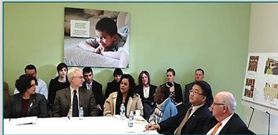
Fresno Housing Authority, CA residents and staff talk about RAD

Your PHA must take several steps when it decides to participate in RAD. First, your PHA must apply for RAD to get HUD's permission to convert public housing properties to Section 8 properties. Before submitting an application, your PHA will invite you to at least two meetings to discuss the conversion plans. During these meetings, you can learn about the conversion plans, ask questions, express concerns, and provide comments.