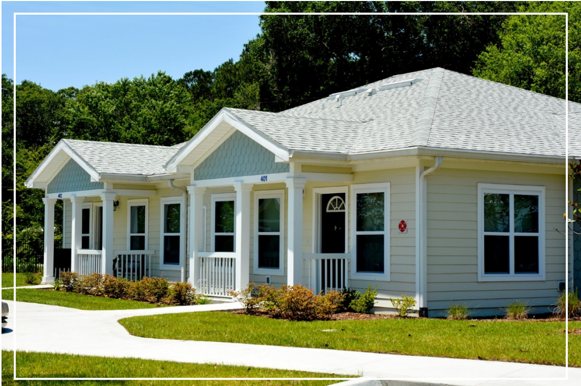
VILLAGE ON WILEY

The housing consisted of a 43-unit apartment complex on Jacksonville’s Westside, Village on Wiley, and 49 units scattered at properties throughout the community that are owned or leased by Ability Housing. Originally, 92 participants enrolled in the study. At the end of two years, 77 were still housed and 68 were still enrolled in the pilot. The final evaluation includes data on these 68 participants.