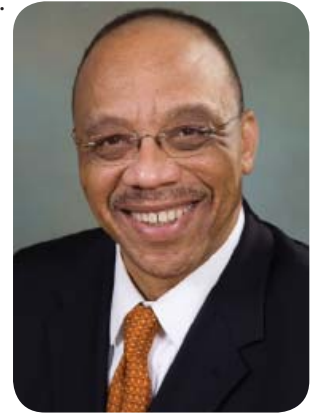
NLIHC Conference Speaker Eugene Robinson

Visit www.nlihc.org for regular updates. Watch your email and mailbox for more information as the conference nears.