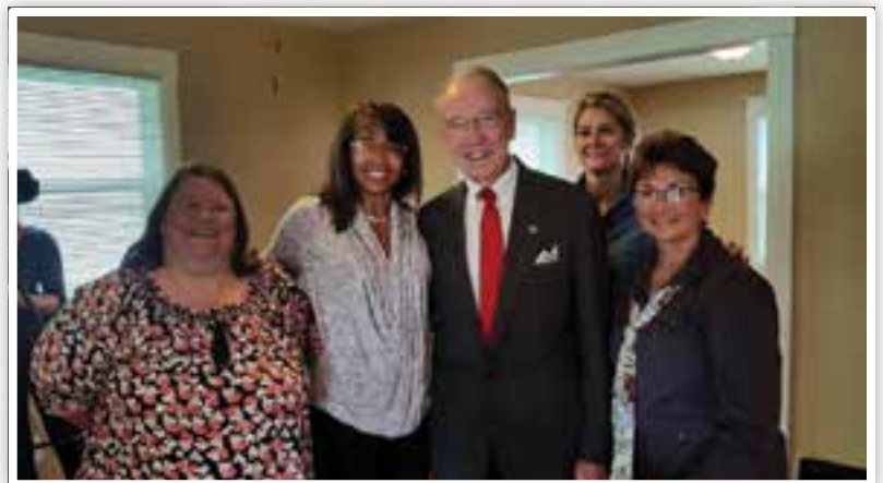
US Senator Chuck Grassley (Iowa) tours our Keeping Families Together supportive housing demonstration site (PUSH-CR) in Cedar Rapids, Iowa, on Saturday, July 12, 2015. The need for additional federal resources to help keep families housed and healthy was raised with Senator Grassley during his visit.