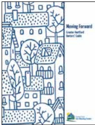
Moving Forward by the Connecticut Fair Housing Center.

Perhaps CFHC's greatest work is in giving residents the tools they need in order to protect themselves against discrimination as they search for apartments. CFHC's Renters' Guide Moving Forward is dedicated to ensuring that renters who want to move can do so, and it has a section dedicated to identifying types of illegal discrimination under the Fair Housing Act, and it instructs tenants on how to contact CFHC to