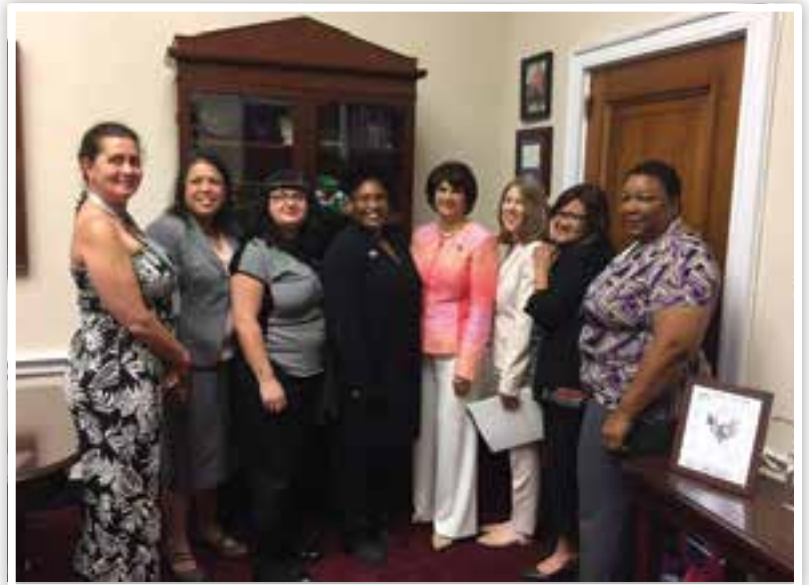
Our Speak Up! Supportive housing resident-community advocates meet with US Representative Lucille Roybal Allard (CA-40) on Capitol Hill (Wednesday, July 15, 2015) to tell their personal stories, how they overcame homelessness through supportive housing, and to request additional federal funding for affordable housing and community-based support services.

CHCDF is a coalition of 70 national organizations, including NLIHC, working together toward the highest possible funding for housing, homeless, and community development programs.